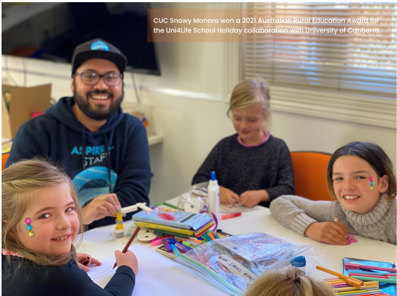
CUC Snowy Monaro won a 2021 Australian Rural Education Award for the Uni4Life School Holiday collaboration with University of Canberra.

Uni4Life is a pilot program that aims to provide consistent, uninterrupted study time across the school holiday period for parents who are studying at the CUC, while simultaneously nurturing the aspirations and understanding of university for their children. In April, over 5 days, the University of Canberra provided outreach activities for the children of parents who study at CUCSM. This allowed parents to study uninterrupted with the support of the on-site CUCSM Learning Skills Advisor. The Program developed the children's understanding of university.