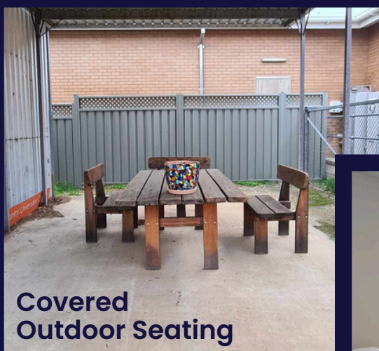
Covered Outdoor Seating