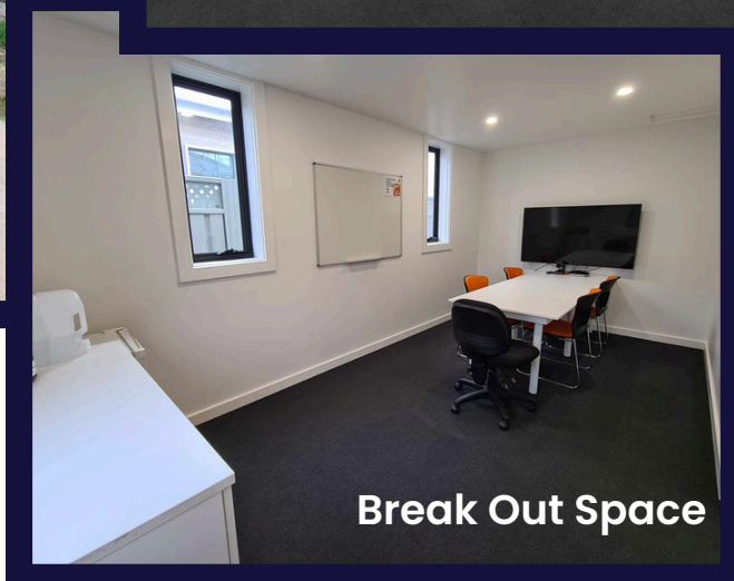
Break Out Space

The guest WIFI password is located in each room